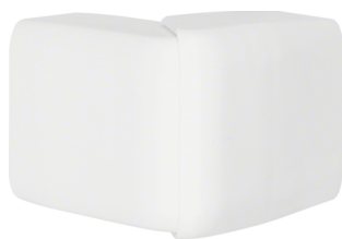
External corner, ATEHA, 16x30, pure white