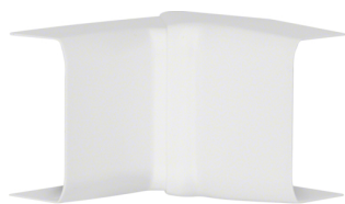
Internal corner, ATEHA, 16x30, pure white