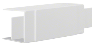
T and X piece, LF 60060, pure white